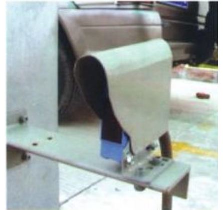
People's mis-entrance checking system