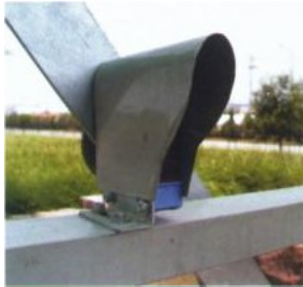
Over-size checking system