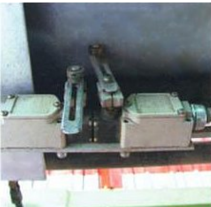
Vertical limit switch