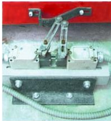
Horizontal limit switch