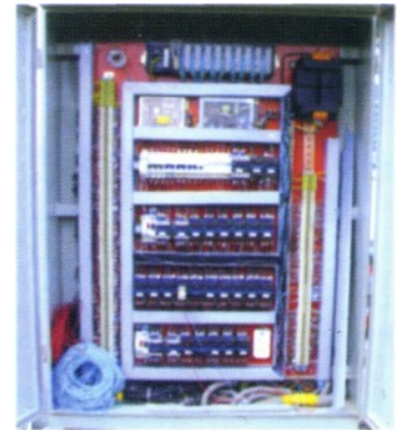
The short-circuit, phase lacking and over-loading protecting system